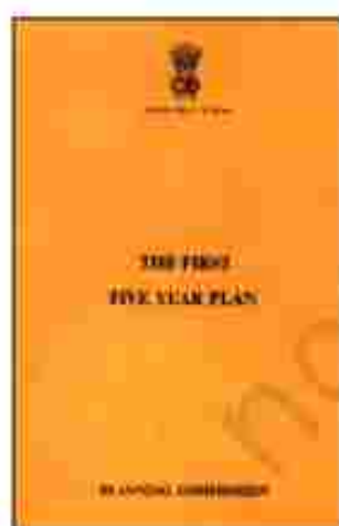
First Five Year Plan document