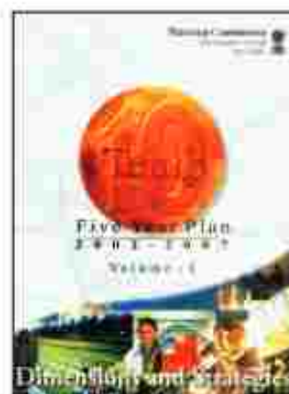
Tenth Five Year Plan document

The Second FYP stressed on heavy industries. It was drafted by a team of economists and planners under the leadership of P. C. Mahalanobis. If the first plan had preached patience, the second wanted to bring about quick structural transformation by making changes simultaneously in all possible directions. Before this plan was finalised, the Congress party at its session held at Avadi near the then Madras city, passed an important resolution. It declared that 'socialist pattern of society' was its goal. This was reflected in the Second Plan. The government imposed substantial tariffs on imports in order to protect domestic industries. Such protected environment helped both public and private sector industries to grow. As savings and investment were growing in this period, a bulk of these industries like electricity, railways, steel, machineries and communication could be developed in the public sector. Indeed, such a push for industrialisation marked a turning point in India's development.